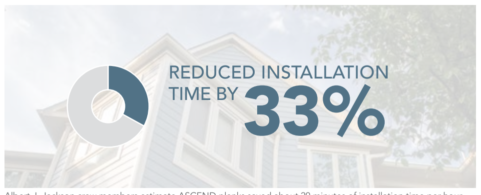
Albert J. Jackson crew members estimate ASCEND planks saved about 20 minutes of installation time per hour compared to a typical fiber cement panel.