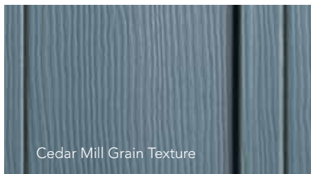
Cedar Mill Grain Texture

Lifetime limited, transferable warranty** for added peace of mind